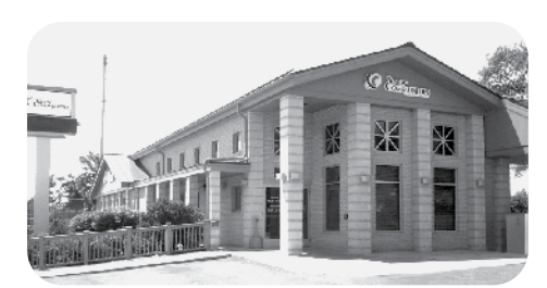
440 8TH STREET SOUTH WISCONSIN RAPIDS