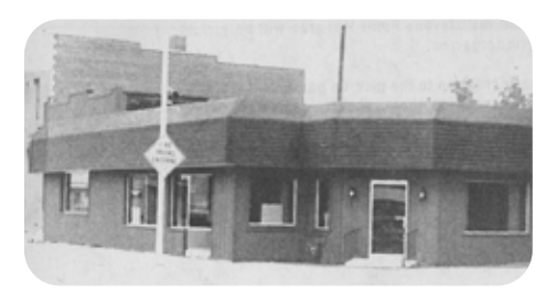
201 MAIN STREET, MOSINEE