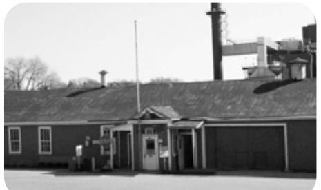
MOSINEE PAPER CREDIT UNION, 1935

Valley Communities Credit Union started as Mosinee Paper Credit Union , chartered by the State of Wisconsin on April 11, 1935 to serve the employees of Mosinee Paper Corporation and their families. Operating from the punch house at the Paper Mill, volunteer directors would use paper scraps to maintain records.